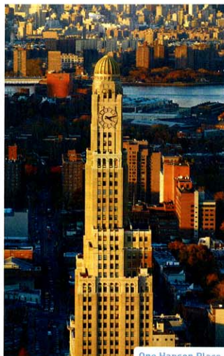
One Hanson Place