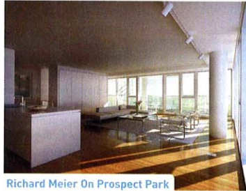
Richard Meier On Prospect Park

7 Which Fort Greene building was formerly home to the Williamsburgh Savings Bank and now features a historically landmarked exterior and ground floor?