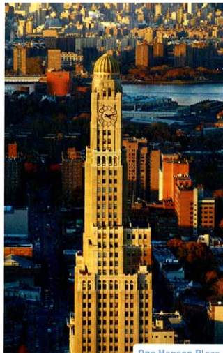
One Hanson Place